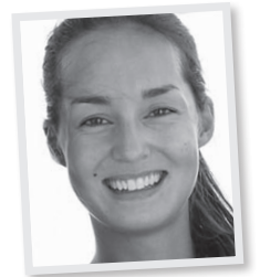
Foto: Poné una foto donde te veas contenta y sonriente. Recordá la imagen es muy importante, a los niños les gustará tener una Au Pair sonriente. Si tenés algún piercing, deberás considerar sacártelo para la foto y durante tu estadía en USA ya que la mayoría de las familias prefieren un Au pair sin piercing. Esta foto será la primera impresión que tenga la familia de vos, así que procurá que sea la mejor.